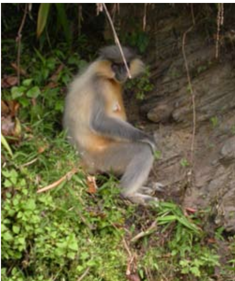
Capped Langur Lisa Moorehead

A checklist of possible birds during the trip is attached at the end of the itinerary.