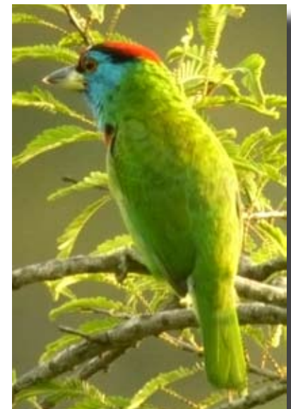
Blue-throated Barbet Sonam Dorji