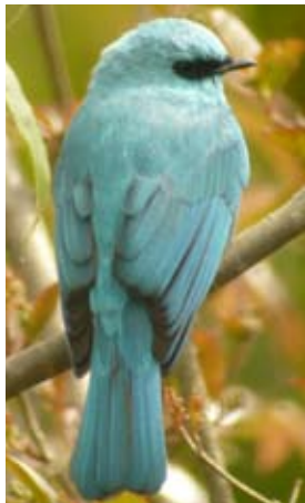
Verditer Flycatcher Sonam Dorji

We may take an early morning walk from camp to look for pheasants along the road. After breakfast, we will drive east. As we near the crest of Thrimingla Pass, 12,000 feet, we will stop and walk through an in-situ rhododendron park, which has over 20 species of rhododendron. There is a high possibility of seeing several flocks of Blood Pheasants and several species of tits and rosefinches. From the pass, the road descends very quickly and hence we will experience tremendous diversity within a matter of a few hours drive. In fact, we will be descending nearly 7,000 feet from the pass to our camp at Yongkhola. One of the spectacular birds that we will seek along this drive is the Satyr Trogon.