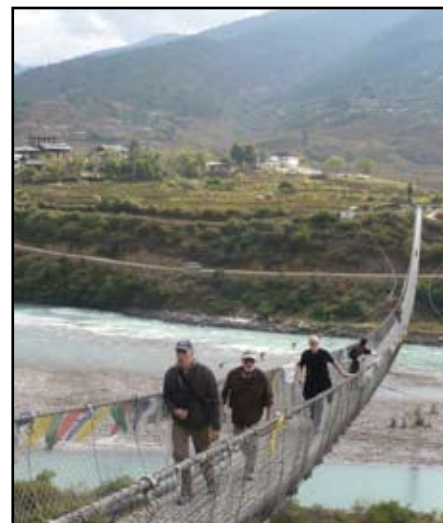
Suspension footbridge across Po Chhu Lisa Moorehead

This morning we will pack up and head northeast. Our first stop will be at the Dochu La pass (3140 m/ 10,362 ft). Dochu La is one of the most spectacular spots in Bhutan with its 108 chortens beautifully laid out across the mountain-top, prayer flags fluttering from the towering pine trees, and the vast Himalaya in the distance.