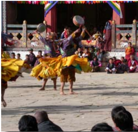
Black-necked Crane festivities

Today is the Black-necked Crane Festival, starting around 9:30 AM. Those who wish to get up early to bird at Pele La pass will depart in the dark for the 30 minute drive to the pass. Pele La's old backroad, contouring along the steep slopes through towering fir trees with panoramic views of the Himalaya, is a great place to look for Himalayan Monal and other high elevation species. The early birders will return to the festival to celebrate with villagers the arrival of the cranes.