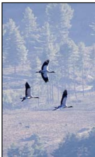
Black-necked Cranes Bruce Easter